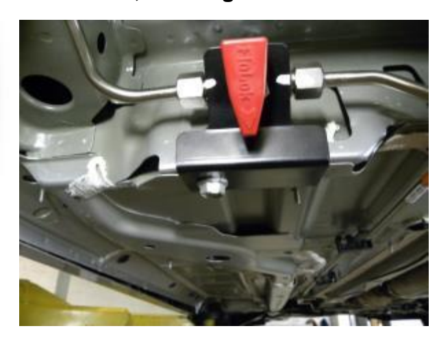
Manual Fuel ¼-Turn Shut-Off Valve OFF, preventing fuel flow