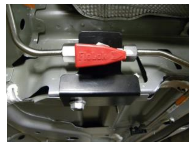
Manual Fuel ¼-Turn Shut-Off Valve ON, allowing fuel flow