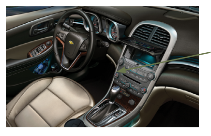
1. Use key or push button to turn off ignition

To avoid accidental reconnection of the cut cable, remove a section of each cable to ensure they cannot inadvertently reconnect.