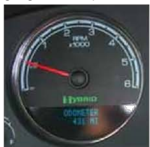
Tachometer with Auto Stop Indicator

A tachometer with Auto Stop indicator and an Economy gauge are unique to these vehicles