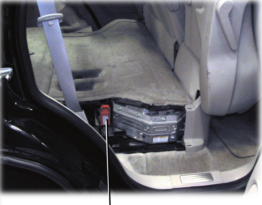
300V Hybrid Battery Manual Disconnect